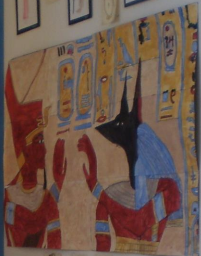
Created by the children in Year 2