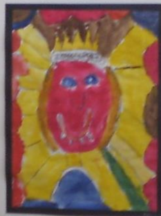
Created by the Artist in Year 2/3