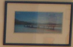
Small white caption card below the third photograph.