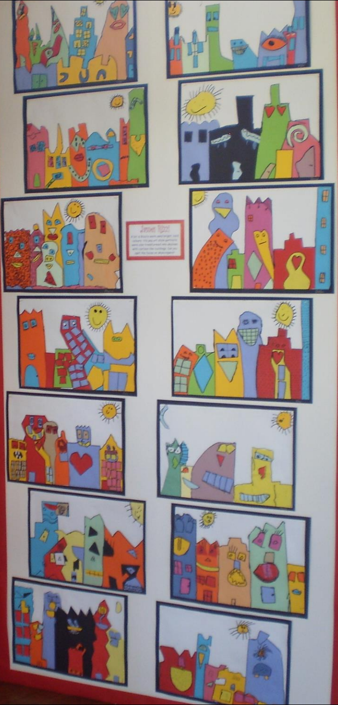
James Rizzi A lot of these were made during his lifetime. He was a very generous person and would often give his work to friends and family. He was also a very kind and generous person.