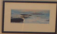
Small white caption card below the fifth photograph.