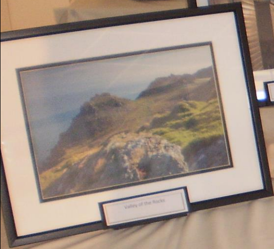
Valley of the Rocks