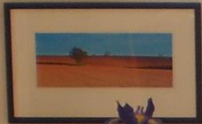
Small white caption card below the fourth photograph.