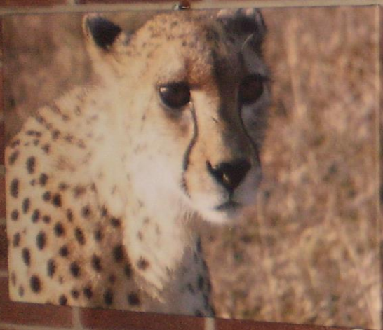
Photographs taken by Jack Council, a former pupil of the school.