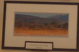
Small white caption card below the seventh photograph.