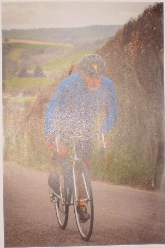
Going over the hill!