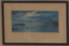
Small white caption card below the first photograph.