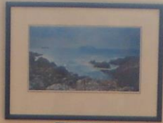
Small white caption card below the second photograph.