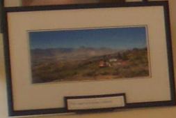
Small white caption card below the sixth photograph.