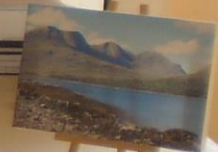
Small white caption card below the photograph on the easel.