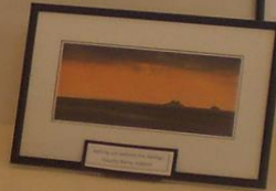
Small white caption card below the eighth photograph.